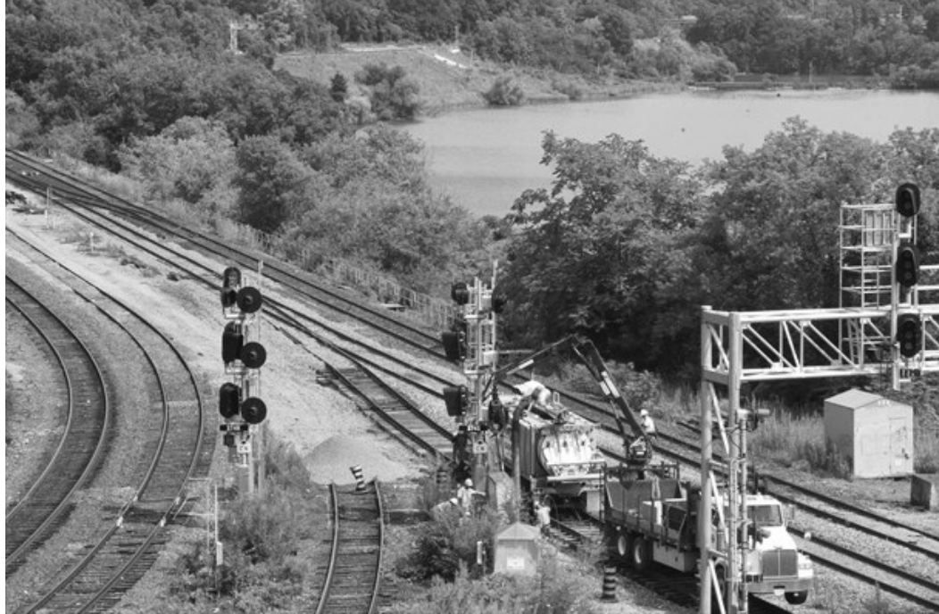
Sabotage by anonymous self-described Canadian settlers at a railway bottleneck in Hamilton, ON. They were acting in direct response to a call to action circulated online titled: 'To Settlers, by Settlers: A Callout for Rail Disruptions in Solidarity with the Wet'suwet'en.'

The third demonstration in the emerging transit movement fighting to win four demands (1. Free fare on the NYC transit system, 2. No cops on the trains or in the stations, 3. The end of police harassment of street vendors and performers, and 4. Full accessibility for all) was a clear escalation from #FTP2 on November 22. Diverse and leaderless affinity groups took up various levels of