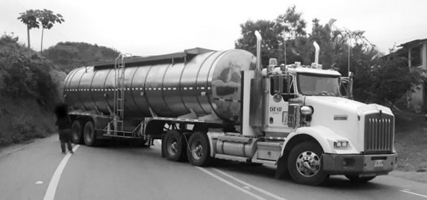
Protesters block a major highway in Ecuador, calling for the dissolution of riot police units.

incident happened along highway BR-226 in the Cana Brava Indigenous Land, which spans 338,530 acres in the state of Maranhão and has 4,500 inhabitants. In protest against the attack, Guajajara tribespeople blocked the highway in both directions.