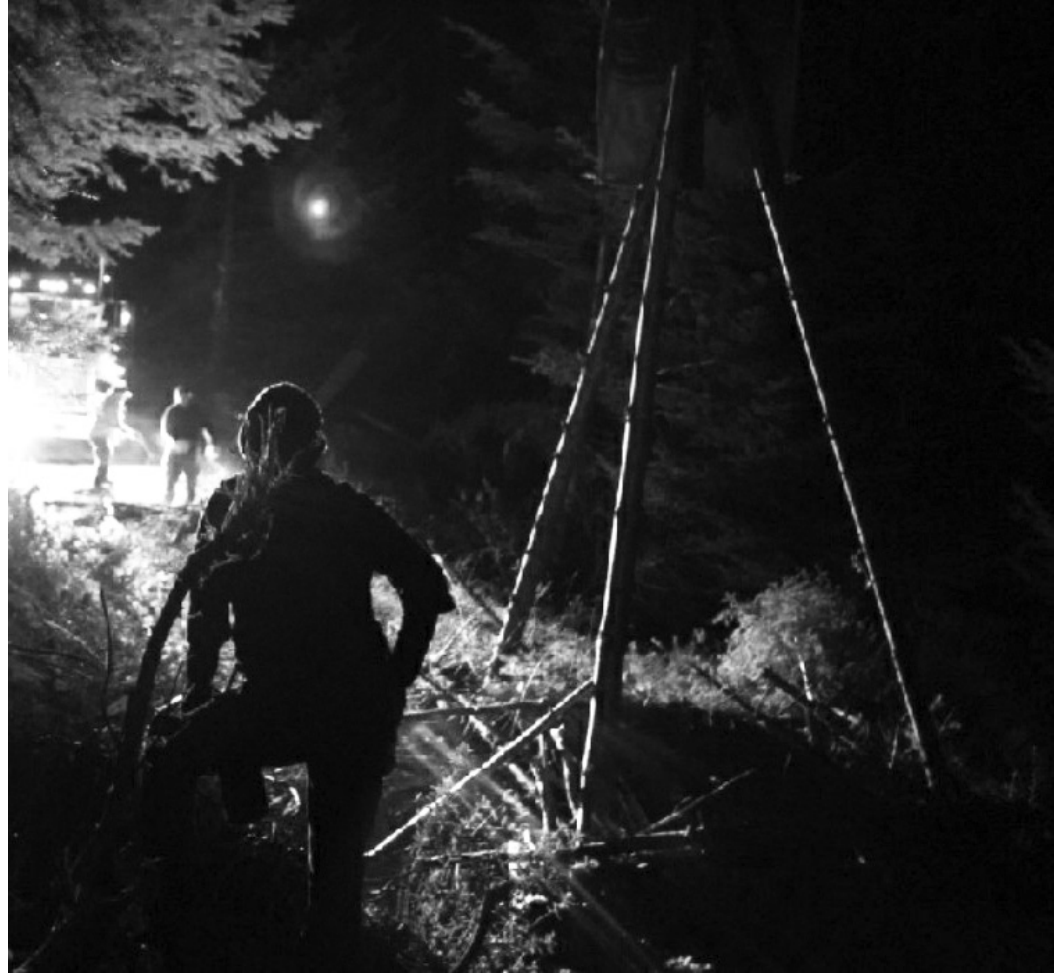
Forest defenders blocking the road at Rainbow Ridge with a 30-foot tripod.

Log trucks were stalled when workers discovered a 30-foot tripod—with a forest defender perched at the apex—blocking a forest road. The tripod blocked vehicle access to a Humboldt Redwood Company worksite for two hours before a logger bulldozed a section of road through the steep hillside. Multiple trucks used it before Humboldt County Sheriffs arrived and told to continue working. Meanwhile, local residents rallied at the logging road access gate. By mid-morning,