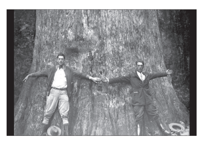
An old photo of The Senator, recently deceased 3,500 year old cypress tree in Florida. See Feb 28, inside, for details.