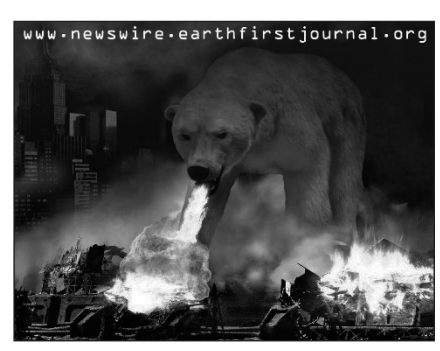
"Peacekeepers" come out to supress F29 protests in Portland, OR; Chevron leaves its mark in the Amazon of Ecuador; Yeah, that's right... Burn it to the ground!