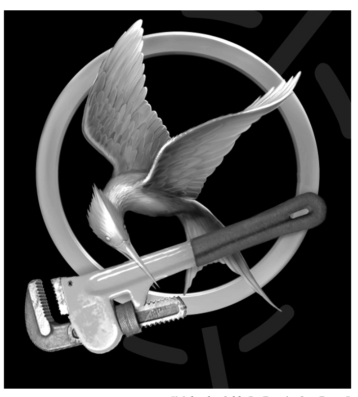
"Make the Odds Be Ever in Our Favor"